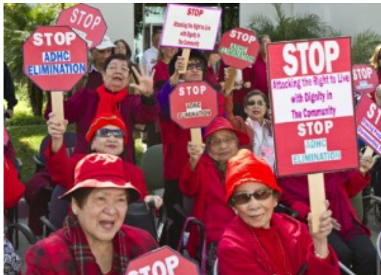
Seniors from throughout the region rallied in Poway Tuesday to protest cuts in Medi-Cal support for Adult Day Health Care Centers.

A rally to protest budget cuts that would close 300 Adult Day Health Care Centers in California, attracted close to 150 supporters Tuesday in a parking lot outside Poway Adult Day Health Care Center in the Poway Business Park.