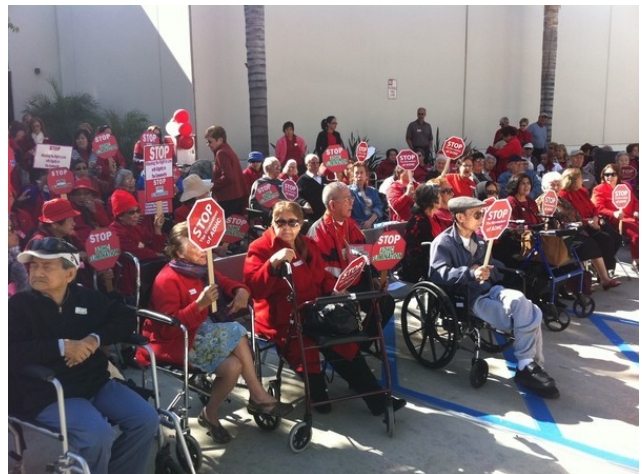
More than 100 people attended the rally.

However, proposals are pending and the state estimates that cuts under AB 97 would result in an estimated $1.7 billion in Medi-Cal funding cuts overall this fiscal year in a program that annually costs the state an estimated $14 billion.